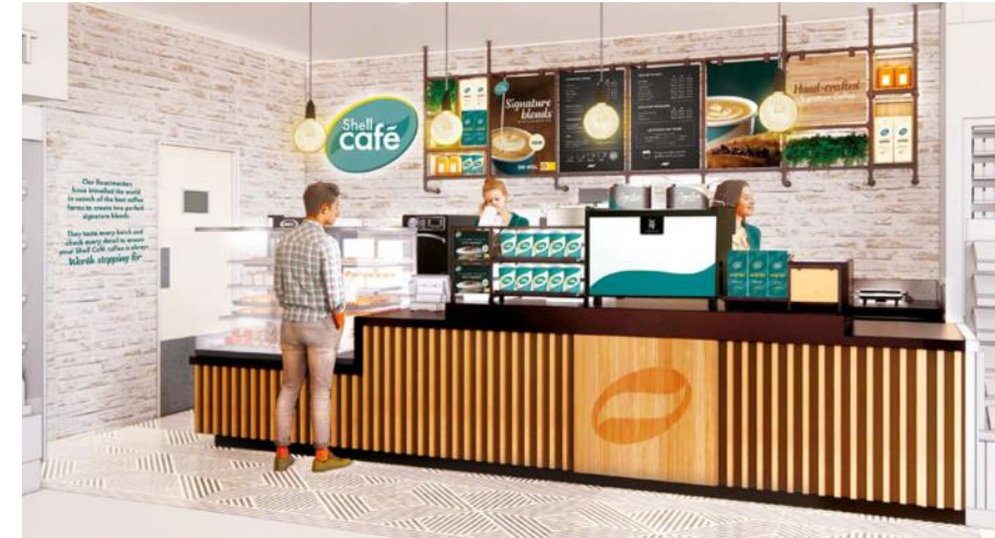
Image: Shell Café

In 2021 Shell was looking to introduce the renewed Shell Café label and drive harmonisation of the brand throughout all markets.