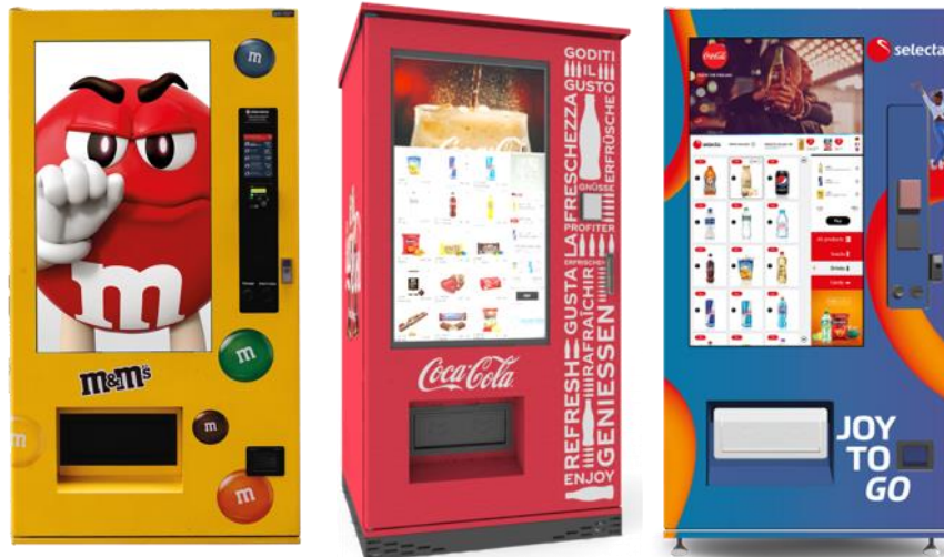
From left to right: Supplier funded Mars & Cocoa-Cola, Selecta Joy To Go

All solutions are available in an indoor and outdoor version