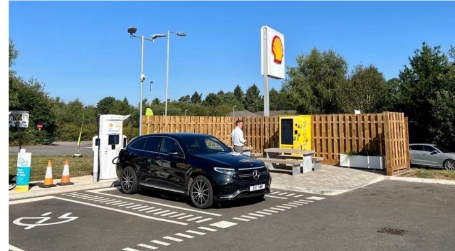
Image: Shell UK EV recharge station and Mars Smart Vending solution

*Pilot UK Selecta & Shell 2022, roll-out Smart Vending solutions, Mars