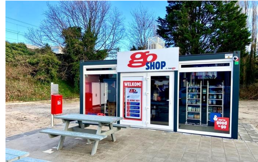
Image: Go shop by Tango, Foodies container store, NL

The extended hours, 24/7 availability, quick checkouts and easily accessible locations, add value for travellers, commuters, anyone.