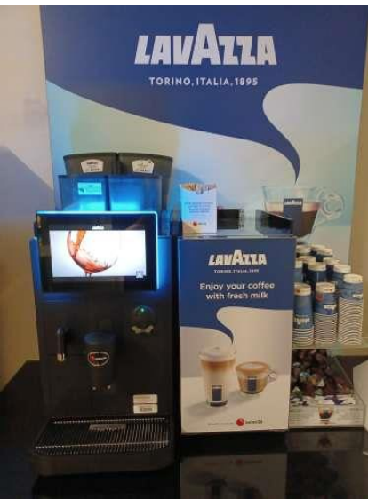
Image: Lavazza solution

Offering an industry leading drinks range, including the classic core line-up, like espresso and cappuccino, as well as iced drinks, tea, plant-based alternatives, and coffee syrups. We want to make sure the presentation in your C-store is as holistic as possible.