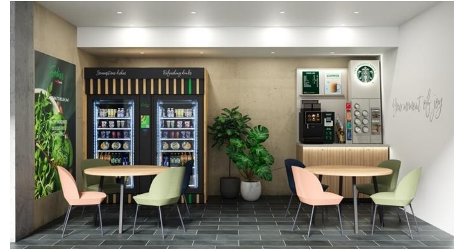
Image: from left to right. Foodies Grab & Go, Smart Fridge. Starbucks Coffee Corner

From approx. 30 product compartments per Smart Fridge, people can select their goods or also return items that have already been removed after checking them. The high-tech, intelligent technology detects whether an item has been taken out and displays the chosen selection on the screen. When closing the door, the machine's software only calculates those products that have been taken.